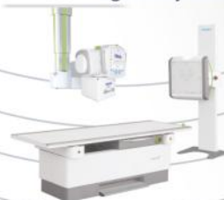
Auto Tracking Digital X-Ray Machine