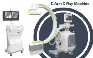
C-Arm X-Ray Machine